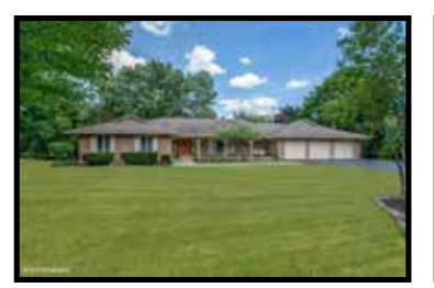
50 Darlington Drive Hawthorn Woods $449,000