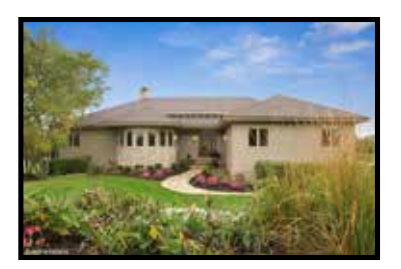
8 Regan Ln, Hawthorn Woods Countryside Glen $579,900

To see more inventory, visit www.HomesWithTeamFamily.com