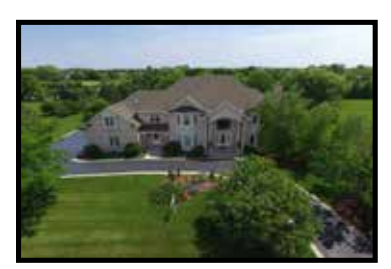
290 Joshua Dr, Hawthorn Woods Countryside Glen $699,000