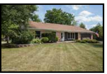
246 Pebblecreek Dr, Lake Zurich Old Mill Grove $319,000