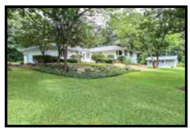
22464 W. Wooded Ridge Drive Kildeer $429,900

Top 1% of RE/MAX agents 2015, 2014, 2013 & 2012 (Individual - Northern Illinois) Five Star Agent 2015, 2014, 2013, 2012 & 2011