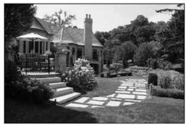
See our portfolio at www.BarnNurseryLandscape.com

Call us at 847-658-3883 ext 23 to schedule an appointment with one of our award winning Landscape Designers.